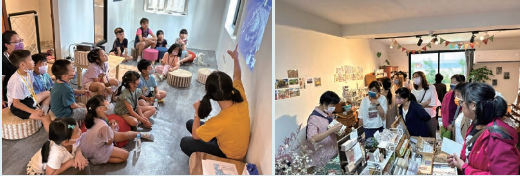
「臺南市新營區微型創新教育體驗基地」空間整備活化後的室內空間使用情形 Indoor space utilization of "Tainan City Xinying District Micro Innovation Education Experiment Base" before and after space activation

To assist county/city governments with meeting operational requirements of regional revitalization businesses, the NDC subsidizes local governments in activating existing public building spaces required by regional revitalization businesses, and also brings in local teams to better utilize the spaces and create mutual benefits. As of October 15, 2023, the regeneration of 46 public building spaces has been approved.