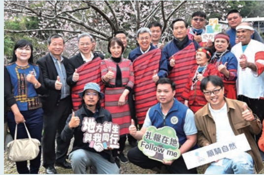
行政院陳院長建仁及國發會龔主委明鑫視察南投縣仁愛鄉「原鄉苦茶生態系統」青年培力工作站情形 Premier Chen Chien-jen and Minister Kung Ming-hsin visit the "Bitter Tea Ecosystem" Youth Empowerment Station in Renai Township, Nantou County

depth tourism, smart transportation, sustainable circulation, and specialty product development. The stations provide a place for practices and strengthen local identity through talent cultivation and knowledge sharing, collaboration in co-creation and coming up with business ideas, local consultation, and linking together networks. This creates mutual benefits and are friendly to society. The stations also propose specific strategies and action measures to create a support system for people to move or return to the area, attracting more partners with a sense of belonging to move or return to the area and engage in regional revitalization.