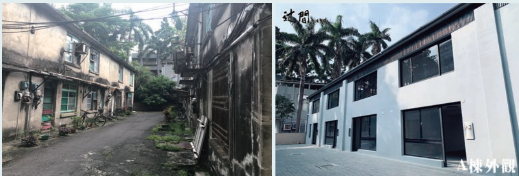
「臺南市新營區微型創新教育體驗基地」空間整備活化前後的建築外觀與環境 Building appearance and environment of "Tainan City Xinying District Micro Innovation Education Experiment Base" before and after space activation

為協助縣市政府推動地方創生事業經營需要，國發會補助地方政府整備活化既有公有建築空間，以完善地方創生事業所需實體營運場域，同時引進地方營運團隊，強化空間使用效能，進而促進在地共好。截至 2023 年 10 月 15 日為止，已核定 46 處公有建築空間進行整備活化。