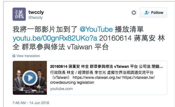
Figure 8 @twccly is a bot posting all video feeds from the parliament

We're working to change the relationship between citizens and governments in all levels in all places by making feedback something that happens automatically, not something governments have to "go get." We've worked to make it so simple to deploy on a daily or weekly basis that there's no excuse to not find out what a given population thinks. That's been really time consuming and labor intensive until now, but leveraging AI will dramatically change the calculation for robust social research. Getting high dimensional, organic feedback from the population during a problem identification phase-as early as possible in the formation of rules-is categorically different from voting. In voting the cake is baked, and there are literally hundreds of issues at stake. The goal is to engage citizens far earlier, when everyone is arguing over the ingredients. At that point, it's not legalese yet. It gives citizens much more leverage in shaping policy, and involves them at the phase the process is most accessible, and their input is most valuable as well. As the complexity of our economy increases, it's critical to increase the speed with which governments