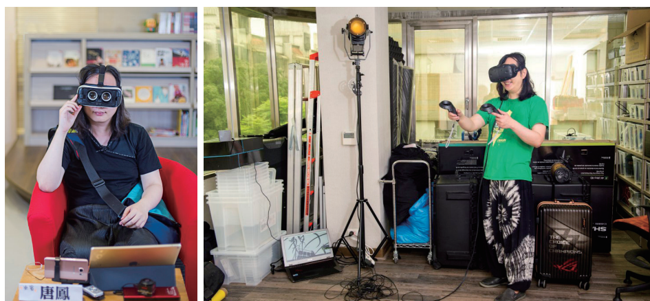
Figure 9 Above: Audrey Tang wearing the facilitator's kit.

DIY moderation in the style of Antanus Mockus 23 , and one key rule: no one on mic. Our goals were multiple, but chief among them was a sincere desire to use the potential offered by this incredibly diverse, international city to rekindle the "talk of the town" without status or pre-determined agenda. The internet is everywhere-ish, yes, but it's geographically-organized public conversation that generate political impact. Our sense of place is inextricable from politics. I admit I am guilty of musing about what is possible in democracies at the scale of island or "island-like" internet-enabled city-states like Taiwan, Hong Kong, ancient Greece, Iceland, even the tri-state area (New York, New Jersey, Connecticut). This vision, however, only makes what's currently happening in Hong Kong all the more painful. In a region where the stakes for these young democracies are so high, freedoms are being revoked: this month, in