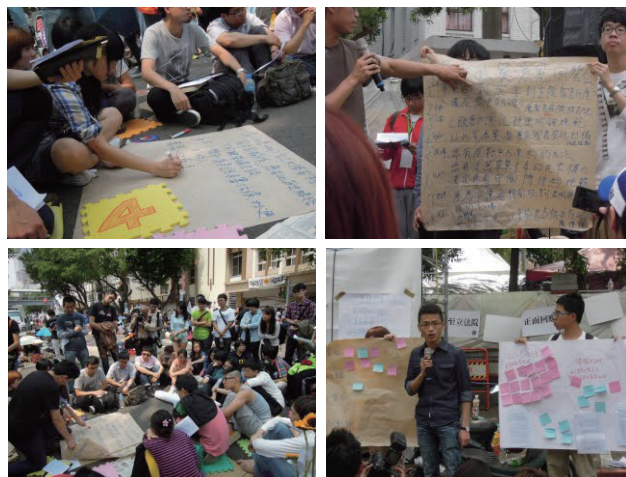
Figure 1,2, 3, 4 photos of facilitating inclusive deliberation in the street during 2014 Sunflower Movement

By May 2016, when I was back in Taiwan to speak at Summit.g0v.tw, I discovered that ever since the Sunflower