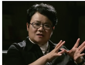
Figure 5 Minister Jaclyn Tsai

We should say, vTaiwan is something of an experiment. Because at the time—if you remember the post-Sunflower days—the entire society was very chaotic. When I worked on cyberspace regulations, often I heard people saying "Minister, this is impossible, you need at least 3 years or 5 years to make progress." But in the business world, because I've been in the technology industry, technology moves much faster. We are in a world of rapid change. How is it possible that each policy always takes 3 to 5 years? That's just not workable. When we think about today's Taiwan, we are a pluralistic society; it's almost certain that there will be different voices for any policy issue. So when there are so many different voices, how can we efficiently reach all the