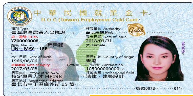
Residents of Hong Kong or Macao