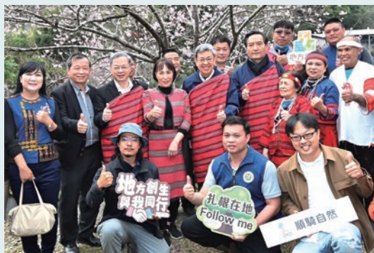
行政院陳院長建仁及國發會龔主委明鑫視察南投縣仁愛鄉「原鄉苦茶生態系統」青年培力工作站情形 Premier Chen Chien-jen and Minister Kung Ming-hsin visit the "Bitter Tea Ecosystem" Youth Empowerment Station in Renai Township, Nantou County

depth tourism, smart transportation, sustainable circulation, and specialty product development. The stations provide a place for practices and strengthen local identity through talent cultivation and knowledge sharing, collaboration in co-creation and coming up with business ideas, local consultation, and linking together networks. This creates mutual benefits and are friendly to society. The stations also propose specific strategies and action measures to create a support system for people to move or return to the area, attracting more partners with a sense of belonging to move or return to the area and engage in regional revitalization.