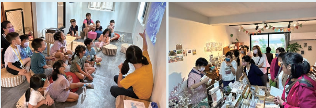
「臺南市新營區微型創新教育體驗基地」空間整備活化後的室內空間使用情形 Indoor space utilization of "Tainan City Xinying District Micro Innovation Education Experiment Base" before and after space activation

To assist county/city governments with meeting operational requirements of regional revitalization businesses, the NDC subsidizes local governments in activating existing public building spaces required by regional revitalization businesses, and also brings in local teams to better utilize the spaces and create mutual benefits. As of October 15, 2023, the regeneration of 46 public building spaces has been approved.