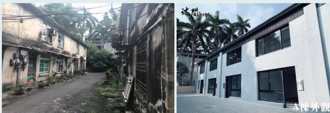
「臺南市新營區微型創新教育體驗基地」空間整備活化前後的建築外觀與環境 Building appearance and environment of "Tainan City Xinying District Micro Innovation Education Experiment Base" before and after space activation

為協助縣市政府推動地方創生事業經營需要，國發會補助地方政府整備活化既有公有建築空間，以完善地方創生事業所需實體營運場域，同時引進地方營運團隊，強化空間使用效能，進而促進在地共好。截至 2023 年 10 月 15 日為止，已核定 46 處公有建築空間進行整備活化。